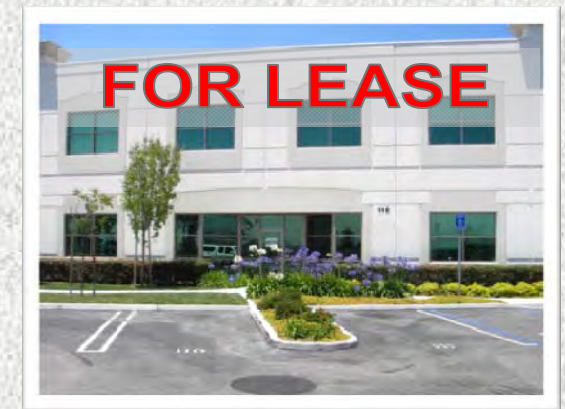
4,106 Office/Warehouse Condo

Inventory Shrinking as Interest Rate Drops!