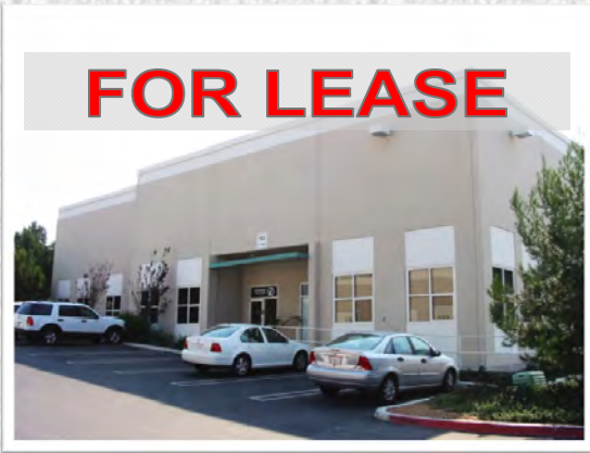
20,500 SF Office/Warehouse Bldg