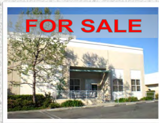
7,144 SF Freestanding Building