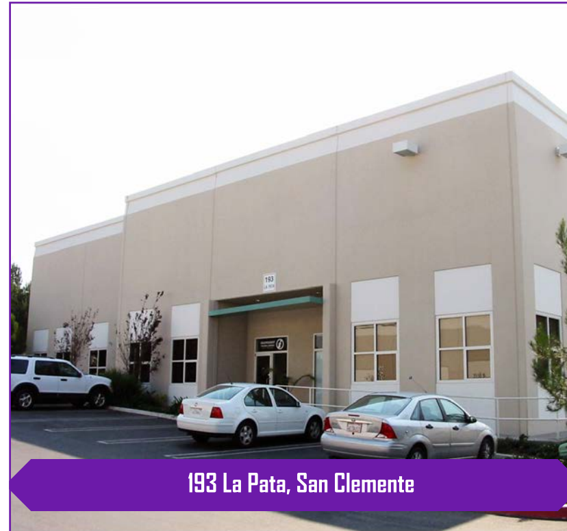
193 La Pata, San Clemente