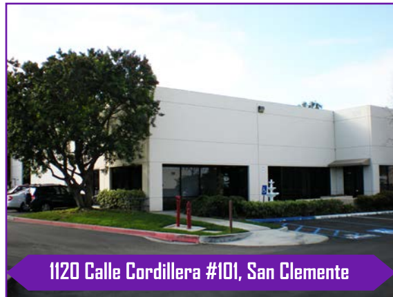
1120 Calle Cordillera #101, San Clemente