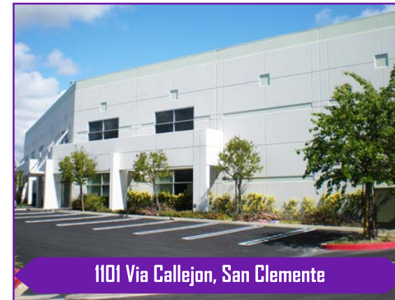
1101 Via Callejon, San Clemente