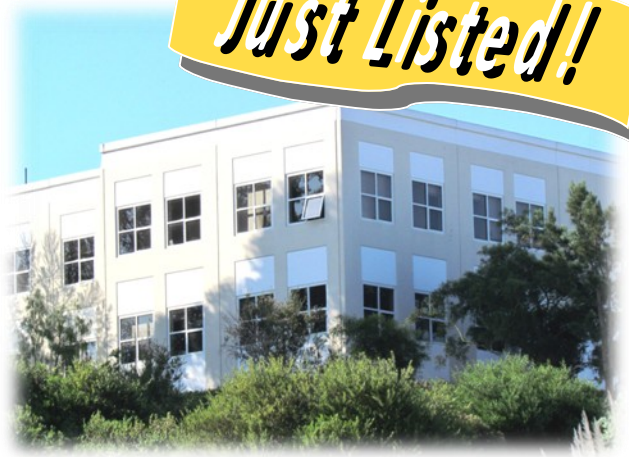
185 La Pata