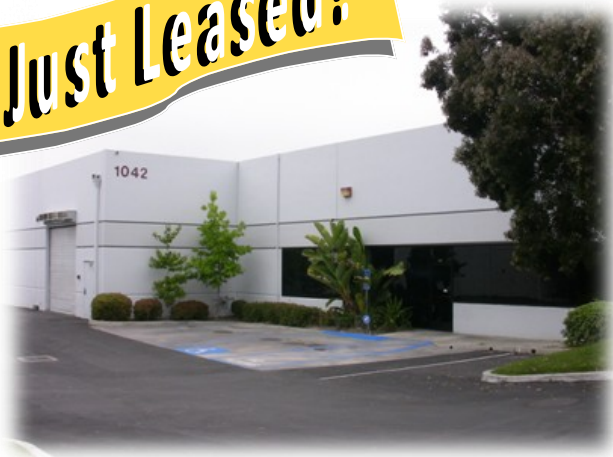
1042 Calle Recodo