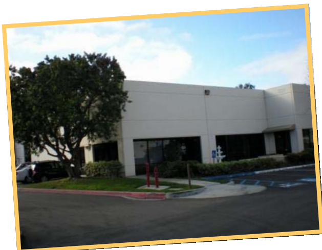
1120 Calle Cordillera #101 San Clemente

Earning the Right to Represent You Since 1991!