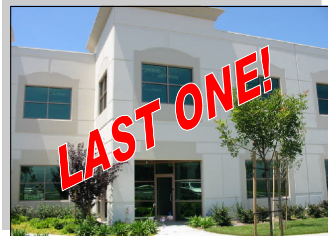
232 Fabricante #109, San Clemente