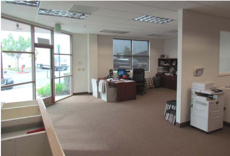
Furniture, computer and phone systems are available.