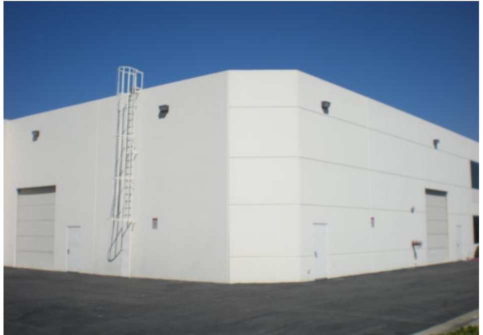
208 Ave. Fabricante, Unit A, San Clemente