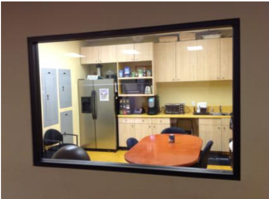
1330 Calle Avanzado, #200 Floor Plan