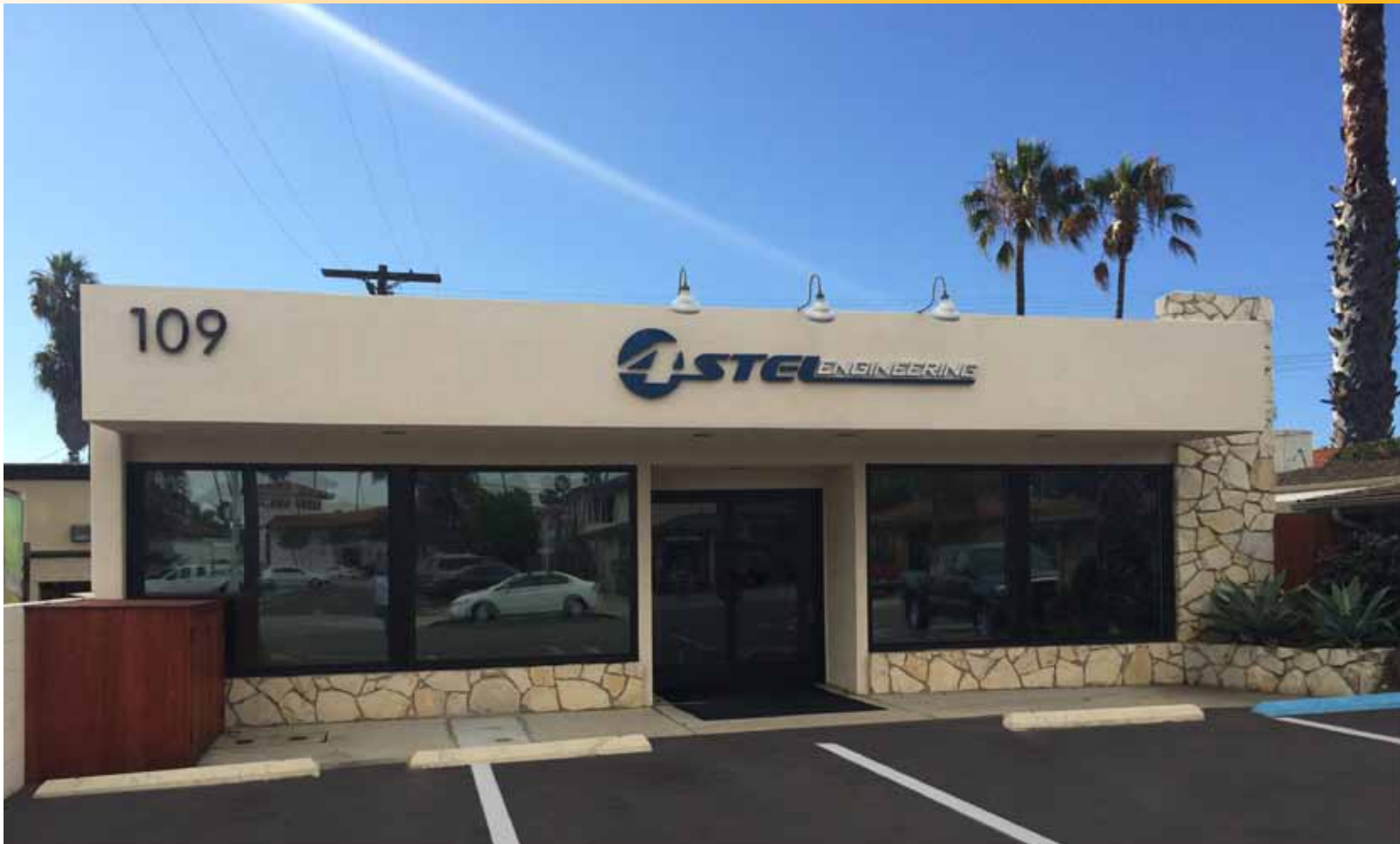
109 E. Escalones, San Clemente